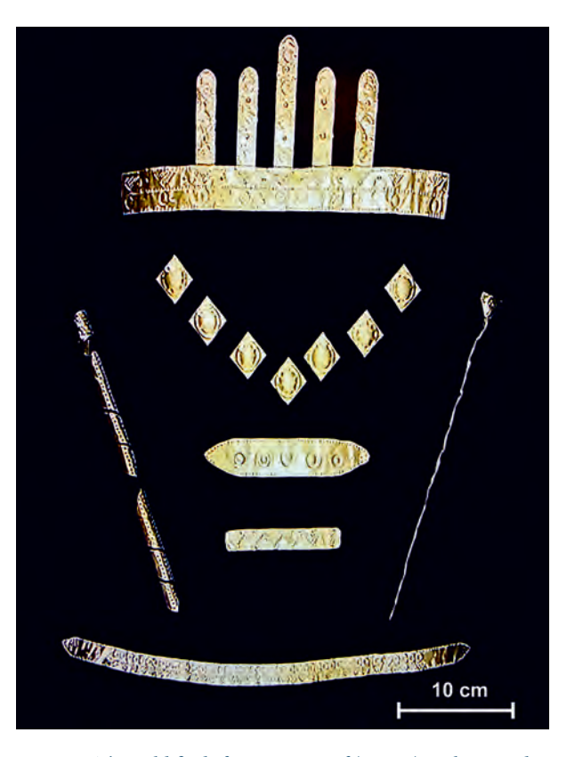
Figure 1. The gold finds from Bernstorf (copies) as they are displayed in the Bronzezeit Bayern Museum in Kranzberg.

The composition of the gold finds was first determined by XRF without clear description of the measurement parameters, but it was noted that the silver concentration was "less than 0.2 %" and both copper and tin concentrations were "less than 0.5 %" (Gebhard, 1999). It was further noted that gold of such high purity is virtually non-existent in nature so that it must be assumed that the gold was desilvered by the cementation process and that this was already practiced in the central